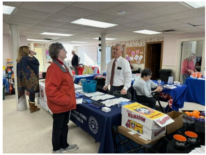
COA Health Fair, 2/14